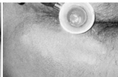
Fig. 2B Anoscopy picture after 12 months.

resuturing under anesthesia to control the bleeding.