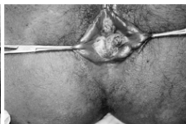
Fig. 2A In-situ radiofrequency ablation of grade III hemorrhoids.