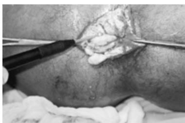
Fig. 1A Radiofrequency coagulation a ball electrode.

Patients were discharged from the hospital only after one bowel movement had been achieved. Outpatient follow up was carried out at 1 week, 2 weeks and 4 weeks after the procedure to assess the duration of post operative pain, time to return to work, wound healing time and early complications like bleeding, urinary retention, seepage and