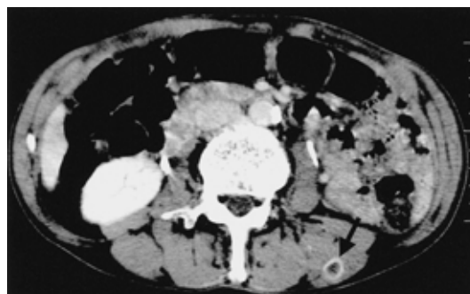
Fig. 1 Abdominal CT taken on admission showed a ring enhanced soft-tissue mass (1.5 cm in diameter) in the left lumbar muscle (arrow head)

He was thus diagnosed as having gastric carcinoma with metastases to the brain, liver, lung, adrenal glands and skeletal muscle. Abdominal CT was taken two months after admission. The tumor in the left