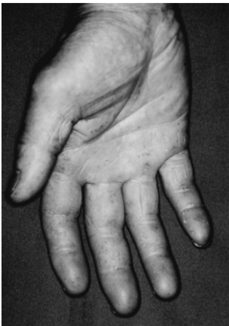
Fig. 1 First interview of patient 1 Right index, middle, third and little fingers are swollen from proximal interphalangeal joints to fingertips. All four fingers and palm were red with scale and crust.

Patient 2 was a 28-year-old male cleaner working at a building site where wooden housing was under construction. On October 29th, 1999, swelling and aches developed in his right hand and fingers after several hours of bleaching wood. His hands were washed with large volumes of cooled tap water. He visited the emergency department of surgery at our hospital, and antibiotics and analgesic drugs were prescribed. However, he visited our clinic on the following day since the aching was exacerbated. At the first interview, his right index, middle, third and little fingers were swollen from the proximal