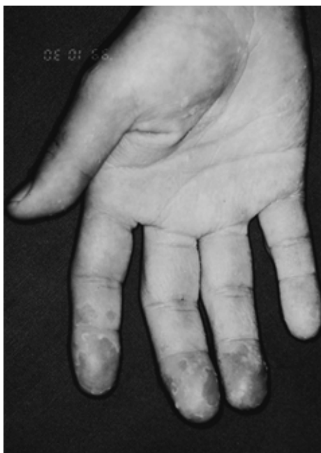
Fig. 3 First interview of patient 2 Right index, middle, third and little fingers are swollen from proximal interphalangeal joints to fingertips. Erythema, epidermolysis and small scales are evident.

Hydrofluoric acid is extensively used to etch semiconductor devices, in cleaning and etching glass, cleaning bricks and aluminum, tanning leather and in petrochemical manufacturing 1-3 . The sites of occupational trauma associated with this agent are usually the fingers. Patients understand the danger of hydrofluoric acid well, and most affected patients inform us that they use this agent. Therefore, diag-