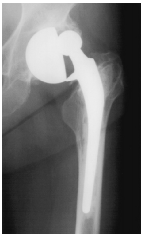
Fig. 1 X-ray findings of the left hip at the time of first visit of our hospital: X-ray examination revealed that the outer head was fixed in varus position, and the inner head dislocated from the outer head.

On July 23, revision surgery was carried out. When the outer head was removed from the acetabulum, there was a loss of the acetabular cartilage with a proliferation of granular tissues.