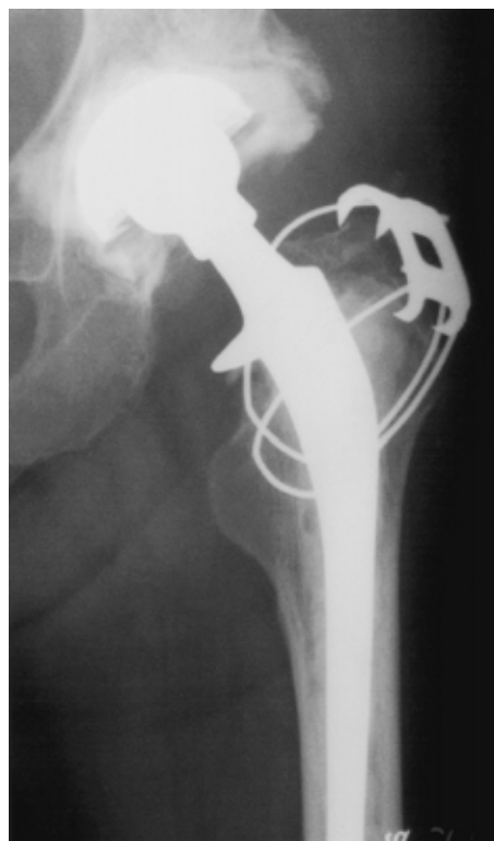
Fig. 3 X-ray findings of the left hip at a 2-year follow-up The acetabular component was placed at the desired 45 \pm 5 degree in relation to the log axis of the body, and no radiolucent zone around femoral and acetabular components was observed.