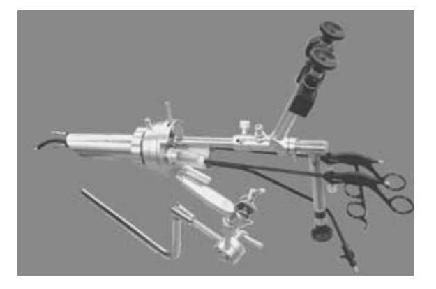
Fig. 1 The rectoscope tube with inserted surgical instruments and stereoscope