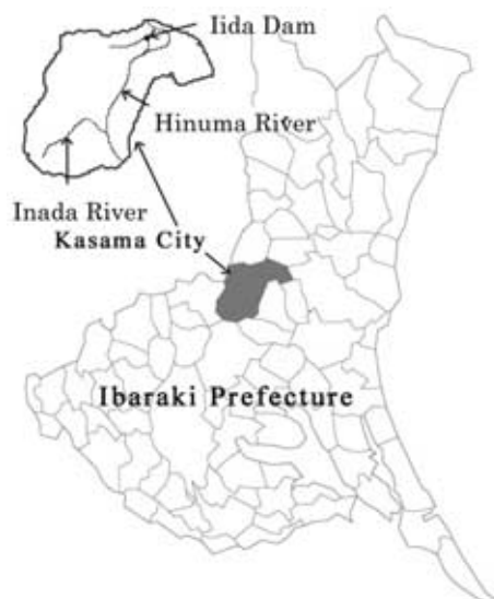
Fig. 2 Map of Kasama City Kasama City lies in west central Ibaraki Prefecture.

1) P = 0.001, 2) P = 0.001, 3) P = 0.001 by unpaired t test