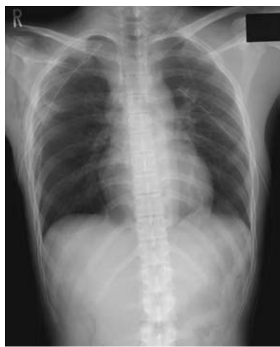
Fig. 2 An chest x-ray film just after simultaneous bilateral pleural drainage. The improvement of the pulmonary collapses is noted.

blood cell (RBC), 529 \times 10^4 ; hemoglobin, 17.0g/dl; hematocrit, 49.0%; platelet count, 31.2 \times 10^4 ; glutamic oxaloacetic transaminase (GOT), 29IU/L; glutamic pyruvic transaminase (GPT), 35IU/L; lactic dehydrogenase (LDH), 258 IU / L; creatin phosphokinaaze (CPK), 517IU/L; total protein (TP), 7.8g/dl; blood urea nitrogen (BUN), 12mg/dl; creatinine, 0.83mg/dl; sodium, 140mEq/l; potassium, 3.6mEq/l; and chloride, 99mEq/l.