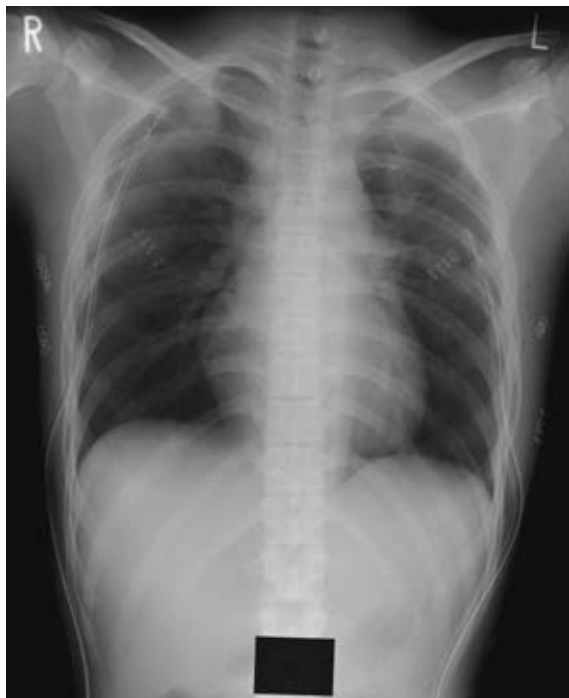
Fig. 4 An x-ray film of the chest just after thoracoscopic surgery. Partial pneumonectomies were performed in both lungs.

region. The surgery was completed by placing a 24-Fr pleural drain in each hemithorax.