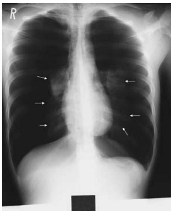
Fig. 1 An x-ray film of the chest on admission. Both lungs are markedly collapsed(white arrow), and the mediastinum is compressed bilaterally. The chest cavity is markedly expanded. The diaphragm has descended bilaterally to an abnormally low position.