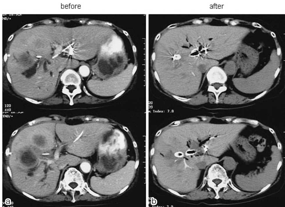
Fig. 1 Abdominal computed tomography showing tumors before (a) and after (b) chemotherapy. a) Tumors have invaded the right and middle lobes of the liver. b) Lesions have decreased in size.

reported as a new, effective anticancer drug for the treatment of advanced biliary tract and gallbladder cancers 9-15 . We report herein the efficiency of chemotherapy using gemcitabine after metallic biliary stent implantation in a patient with unresectable advanced gallbladder cancer.