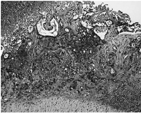
Fig. 3 Biopsy specimen of the gallbladder revealing moderately differentiated adenocarcinoma. Hematoxylin and eosin staining, \times 100 .

determined to be unresectable with massive direct invasion into the hepatoduodenal ligament and liver. Histopathological examination of biopsy specimens from the gallbladder showed moderately differentiated adenocarcinoma ( Fig. 3 ). Two retrograde transhepatic biliary drainage (RTBD) tubes were inserted from the common bile duct into the right and left branches of the bile duct. On postoperative day 13, three expanding metallic stents (EMSs) (Luminexx TM Biliary Stent System; C.R. Bard, Murray Hill, NJ, USA) were implanted in the stenotic lesion following both RTBD tubes ( Fig. 4 ).