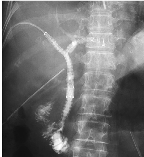
Fig. 4 Metallic biliary stents placed through an RTBD route from the intrahepatic hepatic duct to the lower common bile duct.

On postoperative day 20, systemic chemotherapy, consisting of gemcitabine (1,000 mg) for 1 hour each