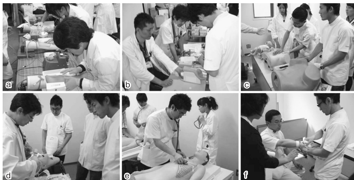
Fig. 2 Photographs of Training Sessions for Clinical Skills

a: collection of venous blood sample, b: collection of arterial blood sample, c: internal examination, d: tracheal intubation, e: auscultation (heart sounds), f: bandaging