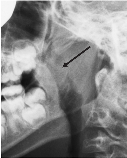
Fig. 1 A lateral neck radiograph shows a markedly enlarged mass obstructing the retropharyngeal airway.

An 8-year-old girl with mouth breathing, snoring, and apnea while sleeping was referred to our hospital. At the age of 3 years, she had received a diagnosis of OSAS based on the presence of typical clinical symptoms and findings from nasopharyngoscopy and polysomnography.