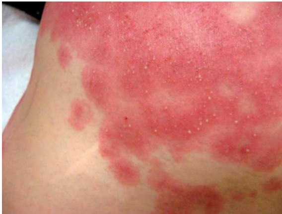
Fig. 1 Numerous tiny nonfollicular pustules appeared on the erythematous plaques.