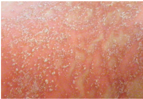
Fig. 3 The patient's body was covered with pustular eruptions, partly forming irregular annular configurations.