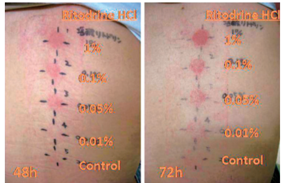
Fig. 4 Four concentrations of ritodrine solution (1%, 0.1%, 0.05%, and 0.01%) and distilled water as a control were applied to the skin of the back and checked after 48 and 72 hours. The results were clearly positive at every concentration of the solution at both 48 and 72 hours after application.

eruptions accompanied by systemic inflammation, we finally decided to resolve the pregnancy. Owing to the severe edema and pain of the thighs, emergency cesarean section was chosen as the delivery mode. A 1,945-g male infant was delivered and transported to the local neonatal intensive care unit because of low birth weight and transient tachypnea. Within several days of delivery, the eruptions began to resolve. The administration of the oral steroid preparation was tapered in a stepwise fashion and finally stopped 31 days after delivery. Forty-one days after delivery, no pustular eruption was observed, although areas of irregular annular erythema remained on parts of the back and extremities.