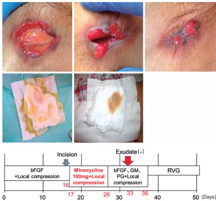
Fig. 2 Clinical course of patient 2 GM: Gentamicin Sulfate Ointment PG: Alprostadii Alfadex Ointment bFGF: Trafermin spray RVG: Betamethasone Valerate·Gentamicin Sulfate Ointment