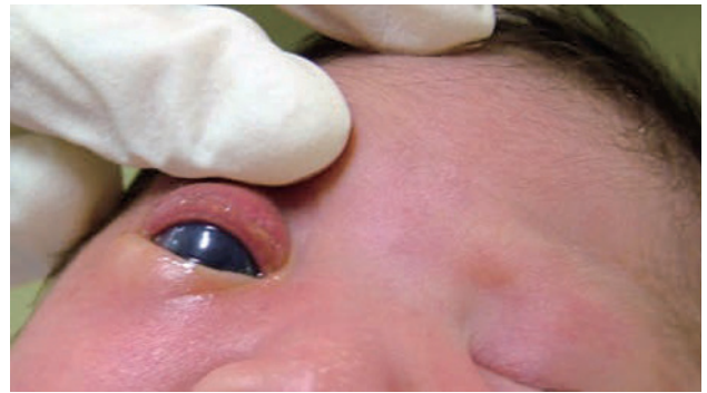
Fig. 2 Clouding in the right eye was observed, and the eye was protruding from the orbit.

less than the mean for the gestational age without lateral molding was detected. The pregnancy had been uneventful, and no significant family history was recorded. Although an elaborate ultrasonographic examination found no additional anomalies, it did reveal peculiar features of the fetal eyes. These features were disproportionate size between both sides of the eye globes, left microphthalmia with an axial ocular diameter of 9 mm (normal average for gestational age is 15 mm), and a relatively large right eye with a hyperechogenic anterior chamber (Fig. 1).