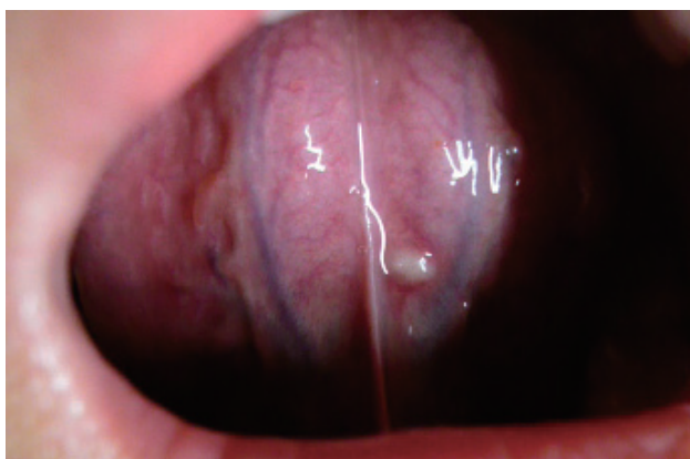
Fig. 1 Clinical appearance. A 7×5-mm-sized nodular lesion with a yellowish-white surface was located to the left of the lingual frenulum on the ventral aspect of the tongue.